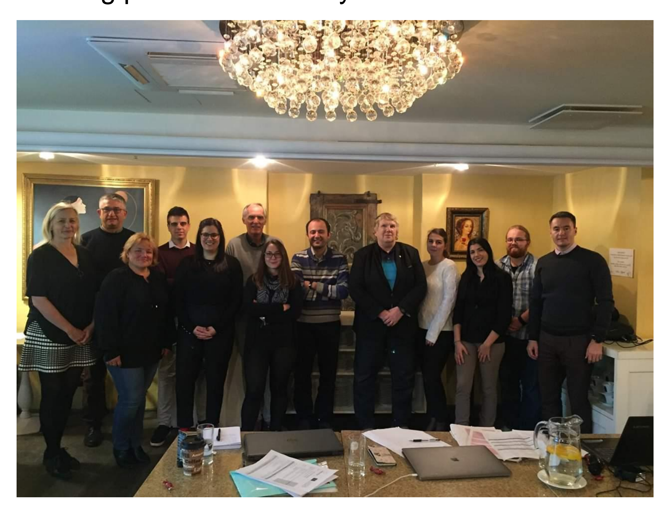
Fig. 2: AUREA4RURAL Transnational project meeting in Tallinn

This study focused on both research and application of augmented reality in rural tourism and the education (Embedded learning approach). The final aim was to create an android mobile application as a digital tool. The implementation of the tool achieved using different AR technologies, programming languages and environments and features and database. In order to manage the contents of the AR tool (media) a content management system (CMS) as a web tool implemented. Furthermore, the learning approach which is embedded in this study is the e-learning platform which completely teach and educate the participants who wants to use augmented reality in rural tourism and improve teaching methods in schools. The e-learning platform provided guidelines about using the implemented AR application. These contents are either short videos or texts as PDF. Both the mobile application and elearning platform are freely available.